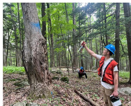
The 2024 Forest Crew (top)

Nyanzu traverses a field of shrubs. This field was later converted into an alley cropping orchard (middle left) (see alley cropping article , p. 7)