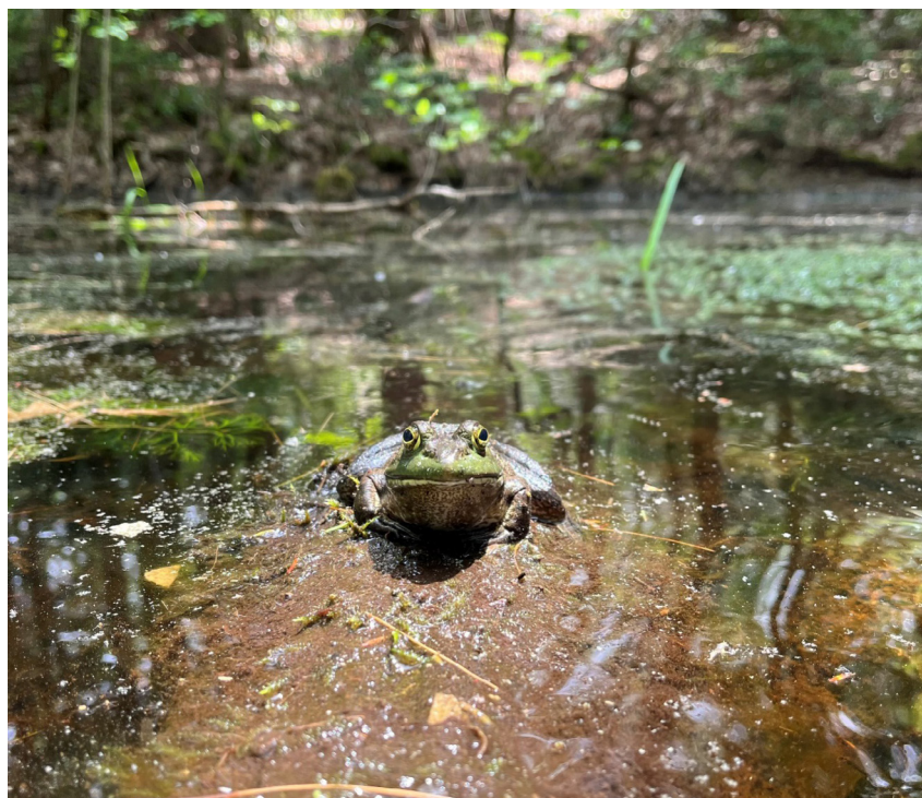
A photogenic green frog on a log.