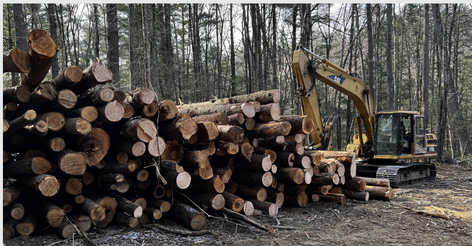
Firewood logs on the landing of Acer Shungus, marked in 2023 and harvested fall 2024.

We hope many of you will visit us at Yale Forests this upcoming year, and we sincerely appreciate your continued support.