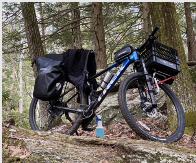
The mountain bike setup Logan used to travel throughout the forest and survey ponds in 2021.

Logan: We know that temperature plays a big role in the progression and severity of ranavirus die-off events. That is logical,