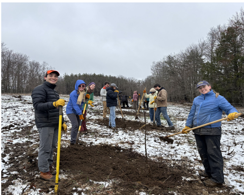
Yale School of the Environment students plant apple trees in the alley cropping field on an unexpected snowy day in April.

Throughout the fall, students working at the forest and in Joe's agroforestry class